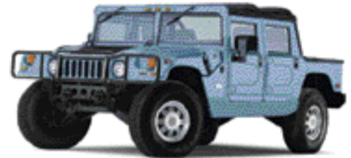
4-DOOR OPEN TOP