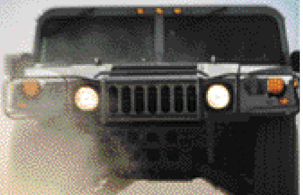
2003 HUMMER H1