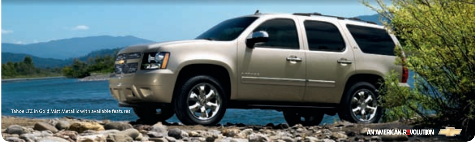
Tahoe LTZ in Gold Mist Metallic with available features

For people who need outstanding efficiency and full-size SUV capability, only Tahoe will do. The 2009 Tahoe XFE offers an EPA estimated MPG 15 city, 21 highway — better fuel economy than any of its competitors! Powerful Vortec engines and the available Z71 Off-Road Package on 2LT models give you the ability to handle daily challenges or leave paved roads behind. Five-star frontal and side-impact crash test ratings 2 and standard head-curtain side-impact air bags 3 for all rows help keep you safe on the road.