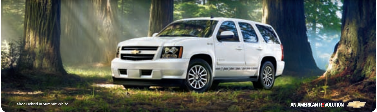
Tahoe Hybrid in Summit White

Meet the two-mode Tahoe Hybrid (at participating dealers only), the first full-size hybrid SUV in America. Tahoe Hybrid delivers the power and capability you expect from a Chevy SUV in a vehicle that's doing its part to reduce our dependence on gasoline. In fact, 2WD models offer the same city fuel efficiency as a standard four-cylinder Toyota Camry 1 and offer an EPA estimated MPG 21 city, 22 highway.